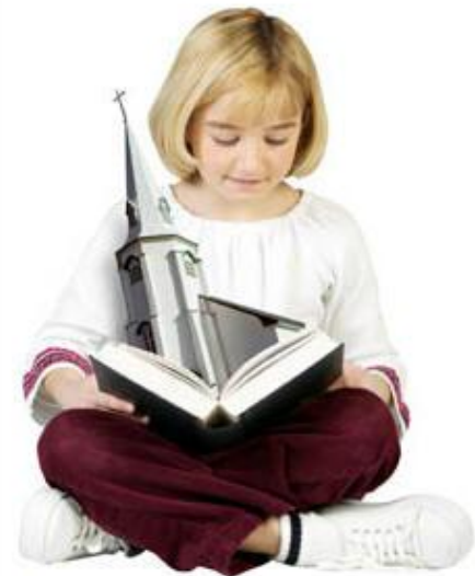
"This is the church, this is the steeple ... "

Now, though, my daughter is 3, and we go to the farmers' market and gym on Sunday mornings, not to services. I like both of those things, and I don't feel that I can in good conscience provide my daughter with the same kind of religious upbringing I had. It would be hypocritical of me; I'm not a believer myself, and I can't quite fake it for her.