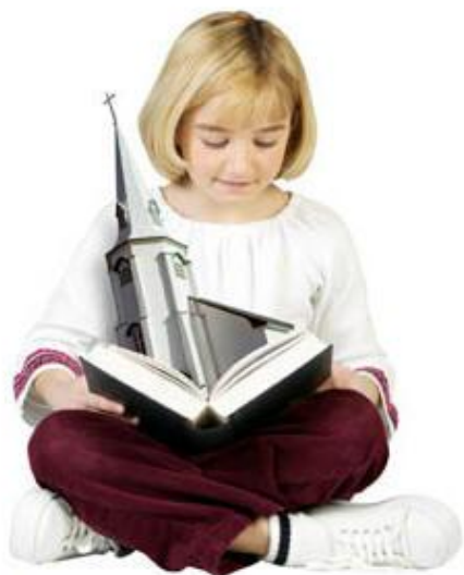
"This is the church, this is the steeple ... "

Now, though, my daughter is 3, and we go to the farmers' market and gym on Sunday mornings, not to services. I like both of those things, and I don't feel that I can in good conscience provide my daughter with the same kind of religious upbringing I had. It would be hypocritical of me; I'm not a believer myself, and I can't quite fake it for her.